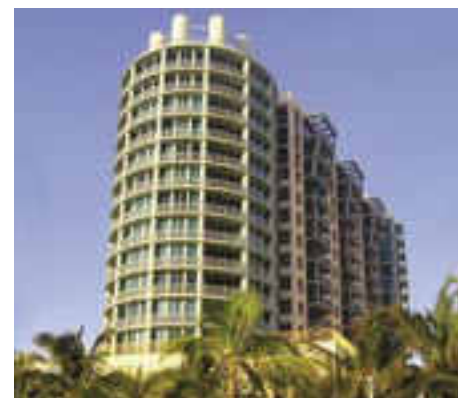
1500 Ocean Drive Miami Beach, Florida