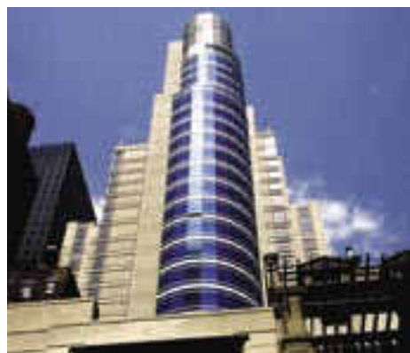
Hotel Sofitel New York New York