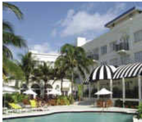
Savoy Hotel Miami Beach, Florida

CMA Companies currently has more than one billion dollars in residential and commercial projects underway. Partners include global banks and renowned Wall Street lending institutions. Accordingly, buyers can rest assured that CMA is well-capitalized and highly motivated to building a condominium hotel that will be so spectacular, it will virtually redefine the category in Orlando.