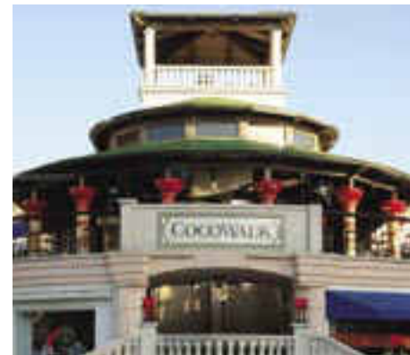
CocoWalk Coconut Grove, Florida